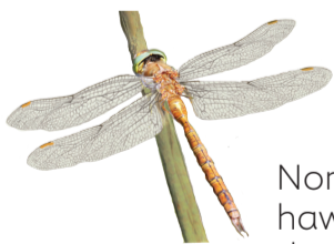
Norfolk hawker dragonfly

Climate change, conservation management work and improved water clarity are among the many things that affect Broads wildlife. Some species have been reintroduced, such as the large marsh grasshopper, natterjack toad, fen raft spider and grass-wrack pond weed. Some rare species have also spread, becoming very slightly less rare, such as the Norfolk hawker dragonfly.