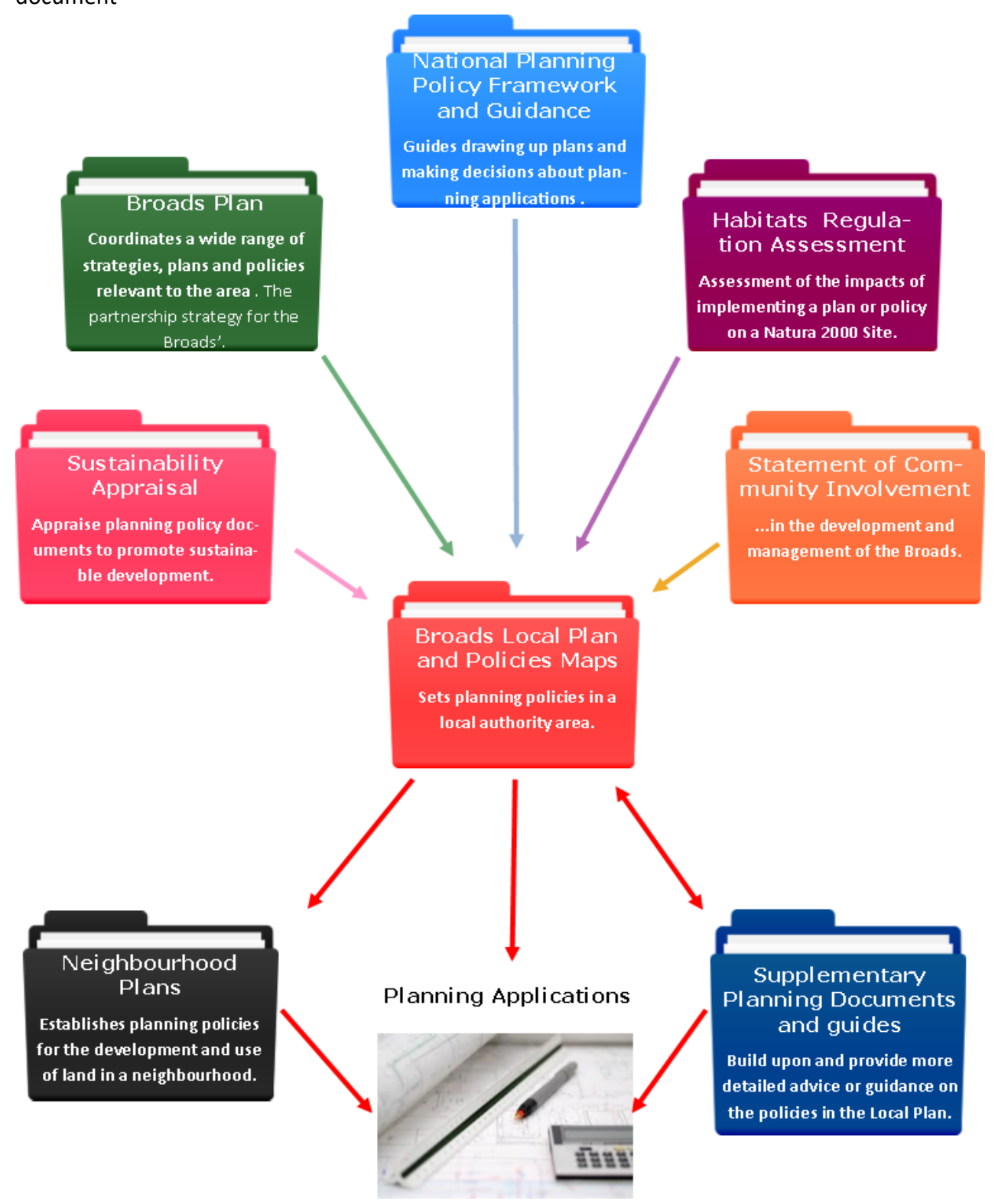
Figure 1 - How various documents relate to the Broads Local Plan and the purpose of each document